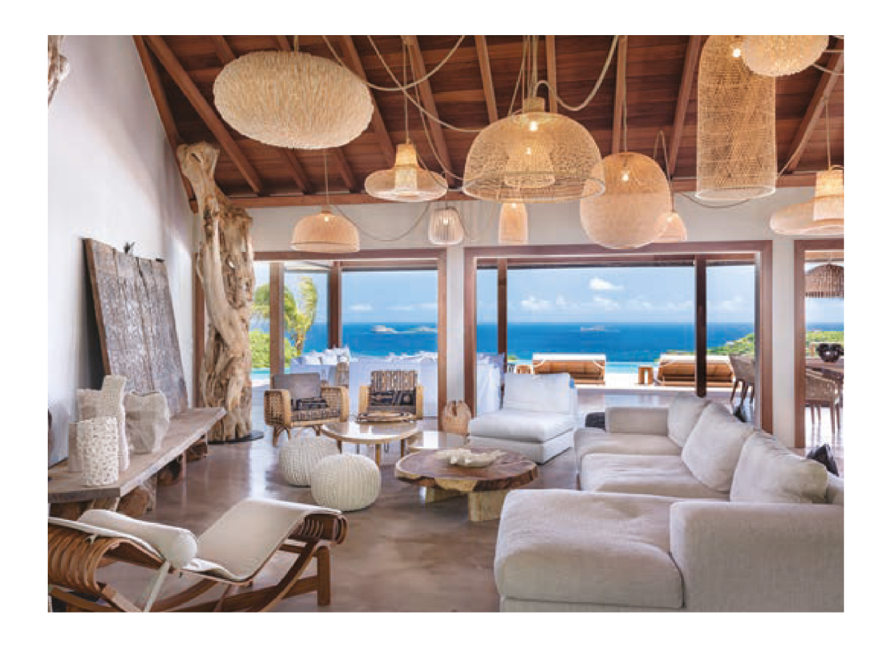
Living room in the Ixfalia villa.

Le Barthélemy's villa rental company has access to 250 of the most luxurious properties on the island combined with 24/7 concierge services, and all the amenities of being a guest at a hotel voted the #1 Resort in St Barths, the #1 Best Resort in the Caribbean and among the Best Resorts in the World by Condé Nast Reader's Choice Awards 2022. Your budget is the only limit on their a la carte menu of experiences.