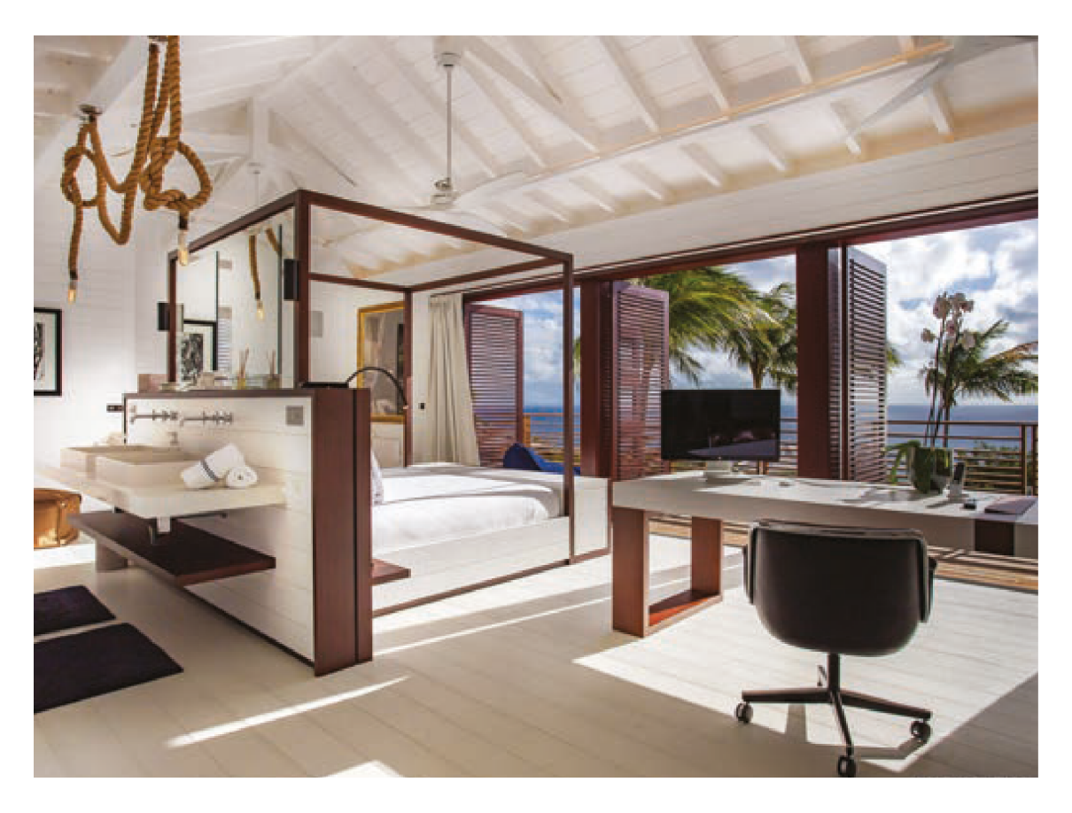
Primary bedroom in Blanc Bleu.

Le Barthélemy's villa rental company has access to 250 of the most luxurious properties on the island combined with 24/7 concierge services, and all the amenities of being a guest at a hotel voted the #1 Resort in St Barths, the #1 Best Resort in the Caribbean and among the Best Resorts in the World by Condé Nast Reader's Choice Awards 2022. Your budget is the only limit on their a la carte menu of experiences.