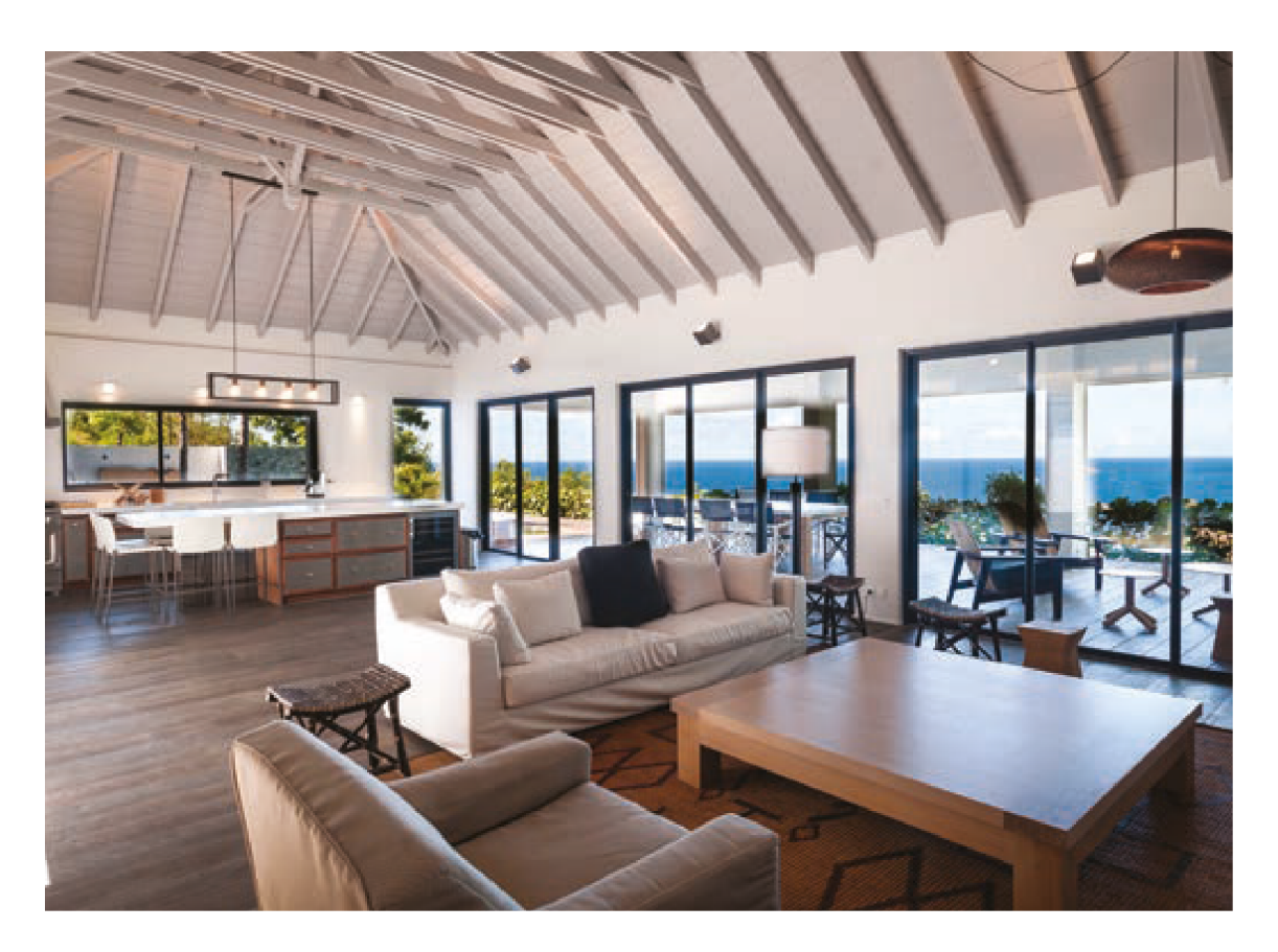
Living room in the Jocapana villa.

Sipping and surveying the alfresco environment of the common areas, I noted that the familiar motifs of island décor are both understated and deliberate and accentuated by whimsical touches, such as birdcage chairs in the reception area. Vibrant pops of color that call to mind the sea, sun, and blue skies contrast with natural textures of rattan, terracotta, wood, and stone.