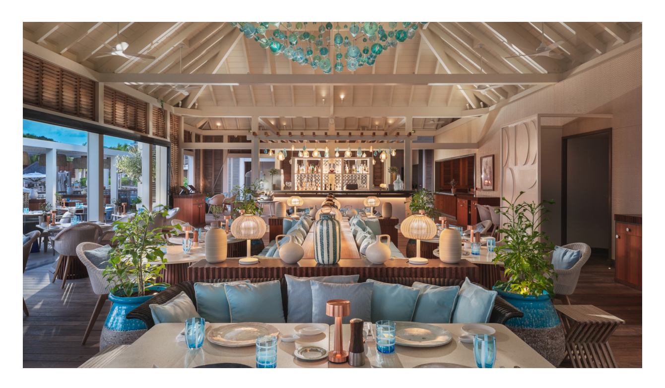
Interior of Amis St. Barth restaurant.

The sky is the limit regarding Amis St. Barths' range of customized dining experiences; we enjoyed a multi-course bohemian beachfront feast illuminated with candlelight and laughter.